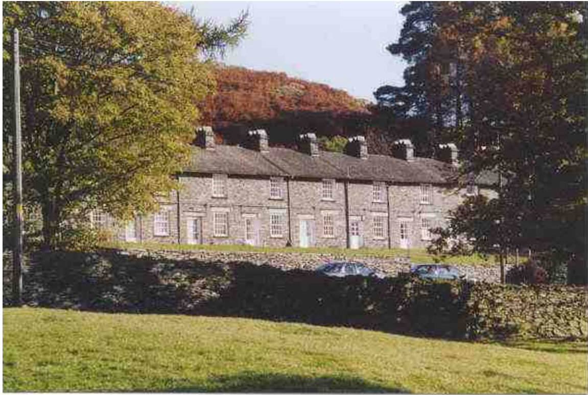
2 Lingmoor View backing directly onto the fell side